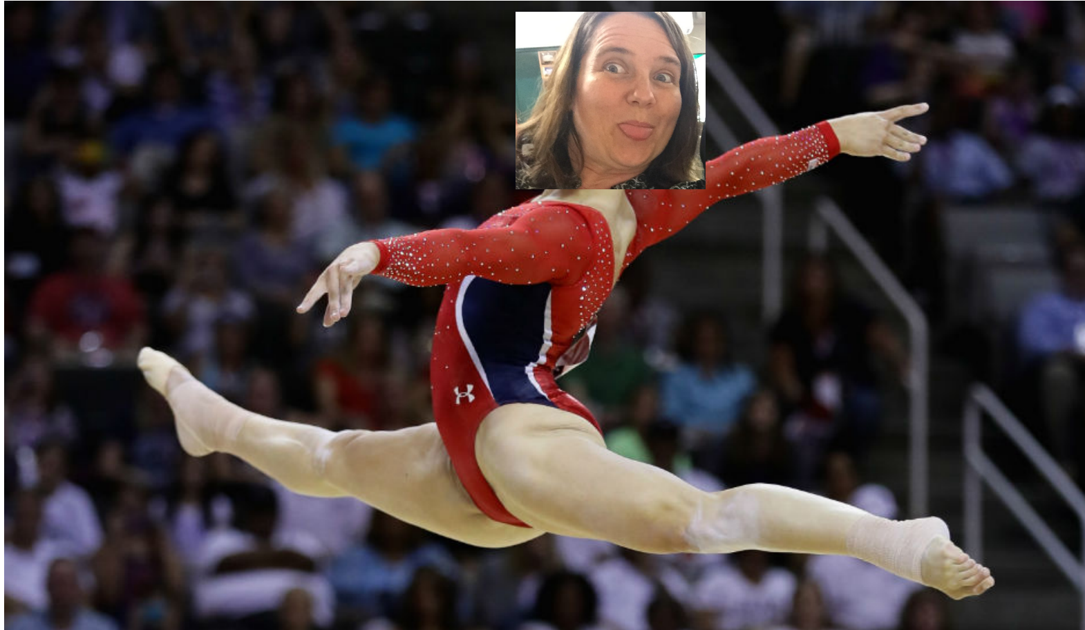
Olympic gymnast Aly Raisman.

How did I get to be here, doing a plenary at EHDI? Perhaps because I couldn't be here... at the Olympics!