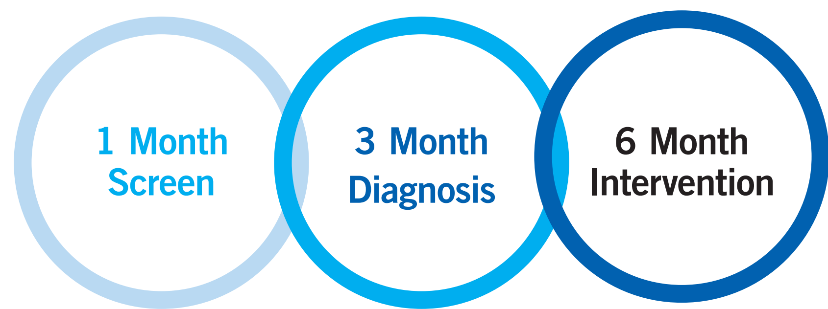
Figure 1. Goal to screen by 1 month of age, have a diagnosis by 3 months of age, and implement early intervention no later than 6 months of age.