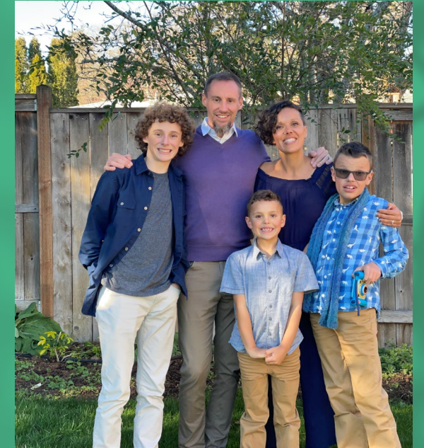
Our Family's' Well-being