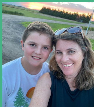
Our DHH Kids